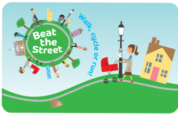
Beat the Street card

Your card and your child's fob/card are not connected , and so you will need to swipe them individually to collect those all-important points.