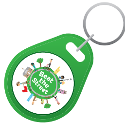
Beat the Street fob